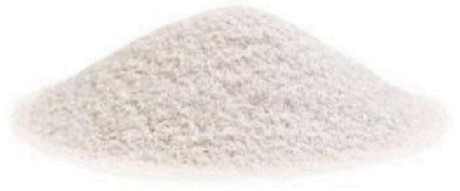
White River Sand