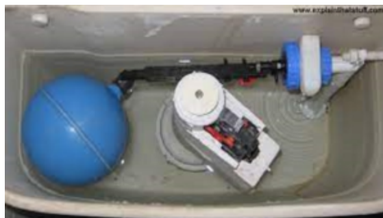
Wall Mounted vs Floor Mounted Toilets

If the loud noise of a flushing toilet is something that bothers you, A wall-hung toilet might be a good choice. Since the tank is inside the wall, the sound of refilling after each flush is much brighter.