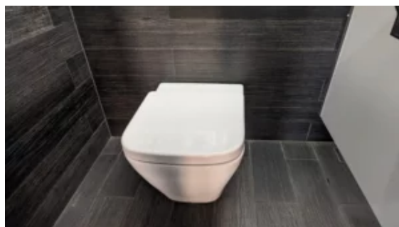
Wall Mounted vs Floor Mounted Toilets

Wall-mounted WC also known as wall-hung Wc. If you want a high-end, modern look for your bathroom go for a wall-hung WC . Its beauty lies in the floating effects created by the commode. This type of WC is fixed to the wall or in other words it is hung on the wall with no part of the WC touching the floor.