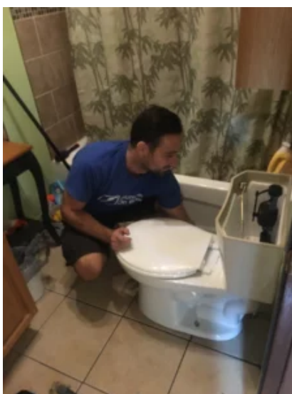
Wall Mounted vs Floor Mounted Toilets

Wall-mounted WC is required thicker walls to accommodate their tank and flushing systems. Many homes may not have thick enough walls which makes them difficult to install. One can construct an extra wall to achieve the required thickness.