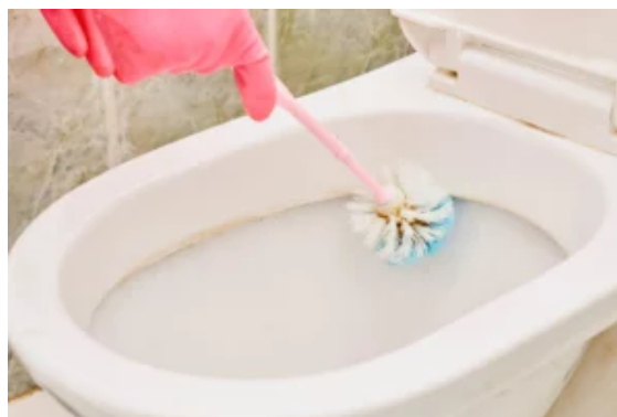
Wall Mounted vs Floor Mounted Toilets

Since the commode is raised and not touching the floor, the bathroom floor is not only easier to Mop and sweep but also more hygienic.