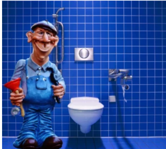
Wall Mounted vs Floor Mounted Toilets